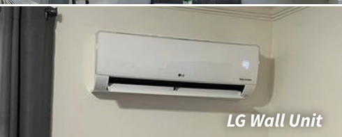
LG Wall Unit