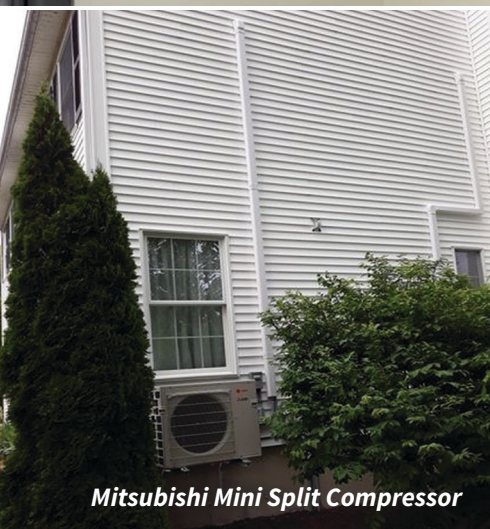
Mitsubishi Mini Split Compressor