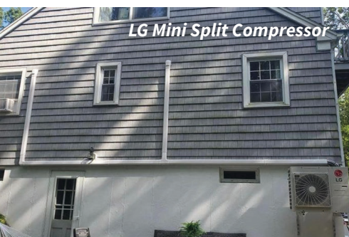
LG Mini Split Compressor

When you invest in upgrading or installing heating or cooling systems in your home, you don't have to sacrifice aesthetics. Denismore technicians pride themselves on quality workmanship, providing excellent form and function, as they would in their own home. See examples of the Denismore Difference through the beauty of our installations.