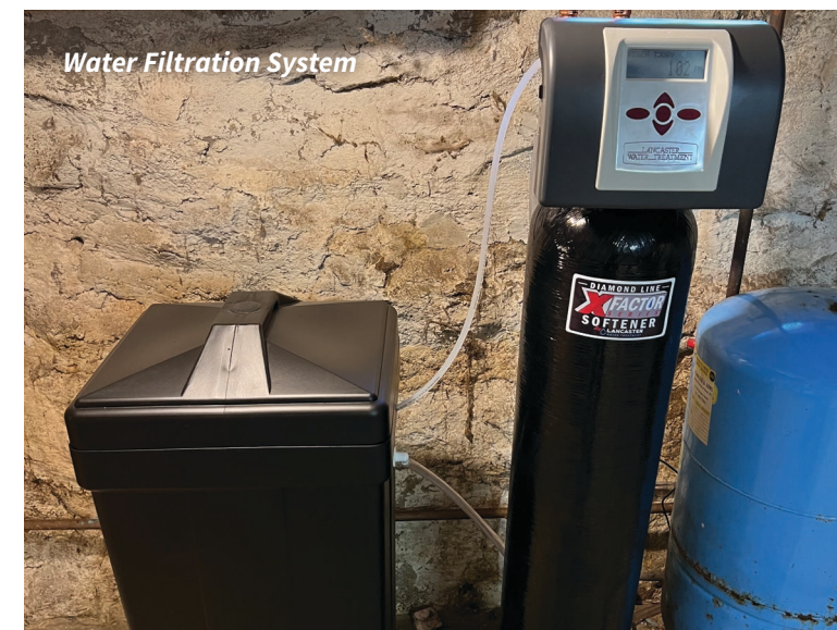
Water Filtration System