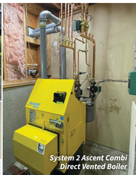
System 2 Ascent Combi Direct Vented Boiler